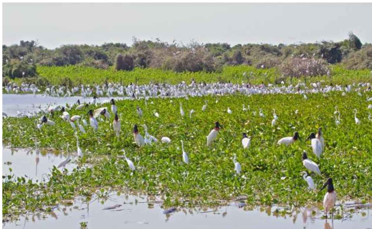
Jabirus and egrets, rio Bento Gomes, Transpantaneira

herons, ibis, storks, cormorants, raptors, and kingfishers will immediately recall Africa to those who have been there. Small birds are equally conspicuous, and daily lists of over 100 species are not unusual. Among the prizes we'll seek are Maguari Stork, Jabiru, Plumbeous Ibis, Southern Screamer, Chaco Chachalaca, White-throated (Gray's) Piping-Guan, Chestnut-bellied Guan, Bare-faced Curassow, Sunbittern, Sungrebe, the incomparable Hyacinth Macaw, Yellow-collared Macaw, Nanday Parakeet, Turquoise-fronted Parrot, Long-tailed Ground-Dove, Nacunda Nighthawk, Buff-bellied Hermit, Blue-crowned Trogon, Toco Toucan, Purplish Jay, Pale-crested and White woodpeckers, Great Rufous Woodcreeper, Red-billed Scythebill, Chotoy Spinetail, Gray-crested (Rufous) Cacholote, Mato Grosso Antbird, Large-billed Antwren, Black-backed Water-Tyrant, Helmeted Manakin, Fawn-breasted Wren, Green-backed Becard, Orange-backed Troupial, Variable Oriole, Scarlet-headed Blackbird, Yellow-billed Cardinal, Rusty-collared Seedeater and others. As an added bonus, our chances for seeing a Jaguar, the most spectacular predator in all of South America, are all but guaranteed. Each of our last 20+ visits here has resulted in amazing prolonged observations of one or more of these magnificent cats, and we have modified our itinerary in recent years to make our odds of success even more certain.