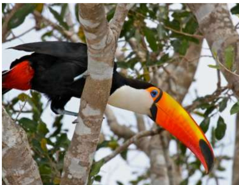
Toco Toucan, SouthWild Pantanal lodge

The Transpantaneira itself is a source of wonder. Developed in the 1970s as an ill-fated plan to connect the Brazilian interior with Bolivia via an overland route, the project ultimately halted in the wake of a funding shortage and insurmountable challenges attributable to geography and climate. Remarkably, the resulting road became a boon for wildlife viewing. Although a