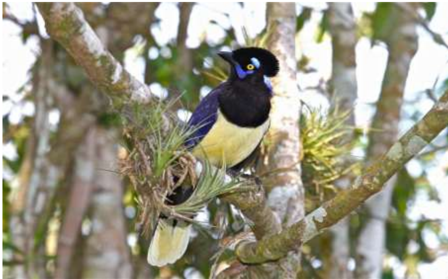
Plush-crested Jay, Iguaçu Falls NP, Brazil

August 4-5, Days 3-4: Iguaçu / Iguazu National Parks (Brazil & Argentina). Through special arrangements with the Brazilian Park Service, we'll plan to spend the first full day in a more remote, less accessible part of the park where we will seek the more forest-restricted birds of the area. The avifauna here has an Atlantic rainforest component and among the more spectacular birds that we'll be searching for are the Black-fronted Piping-Guan, Red-ruffed Fruitcrow, Spot-billed Toucanet, Toco and Red-breasted toucans, Rufous-capped Motmot, Surucua Trogon, Blond-crested and Robust woodpeckers, Band-tailed Manakin and Plush-crested Jay. Smaller birds will not be neglected, and indeed, much of our time will be spent searching for roving mixed-species flocks which may yield numbers of birds such as White-throated and Olivaceous woodcreepers; Black-capped, Ochre-breasted, and White-eyed foliage-gleaners; Three-striped Flycatcher; Gray Elaenia; Southern Bristle-Tyrant; São Paulo Tyrannulet (endemic); Creamy-bellied Gnatcatcher; Rufous-crowned Greenlet; Blue-naped Chlorophonia; and Green-headed, Black-goggled, and Guira tanagers.