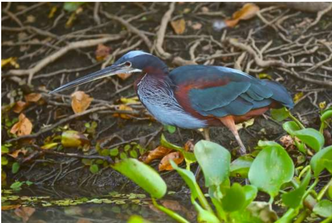
Agami Heron, rio Pixaím, SouthWild Pantanal lodge

August 8, Day 4: SouthWild Pantanal and the rio Pixaím. Dawn on Day 4 will bring an astonishing flurry of bird activity as we continue our Pantanal adventure. Just tearing ourselves away from the lodge feeders, which regularly host spectacular Toco Toucans, raucous Chaco Chachalacas and Purplish Jays, and mobs of smaller birds including flashy Yellow-billed Cardinals, will be a challenge. The gallery forest and brushy pastures along the rio Pixaím are alive with birds, among them Blue-crowned Trogon, Rufous-tailed Jacamar, Black-fronted Nunbird, White-wedged Piculet, Pale-crested and Golden-green woodpeckers, Red-billed Scythebill, Narrow-billed Woodcreeper, Pale-legged and Rufous horneros, White-lored and Rusty-backed spinetails, Great Antshrike, Band-tailed Antbird, Plain Antvireo, Helmeted Manakin, Stripe-necked Tody-Tyrant, Fuscous Flycatcher, Rufous Casiornis, Purplish Jay, Masked Gnatcatcher, Ashy-headed Greenlet, Silver-beaked Tanager, Orange-backed Troupial, Variable Oriole, Red-crested Finch and many others. Such is the diversity of birdlife here that we could easily have seen more than 100 species before breaking for lunch! Our exact schedule over the next few days will remain flexible, allowing us to exploit changing water levels and birding conditions to full advantage.