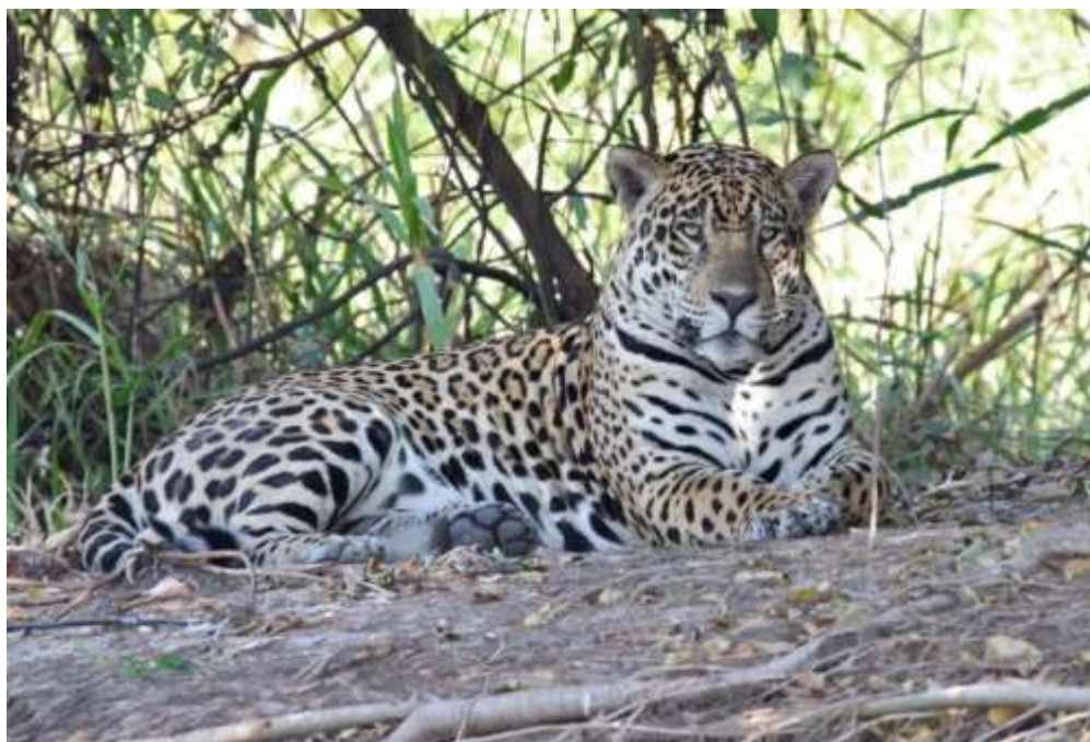
Jaguar (male), rio Tres Irmãos, Pantanal

This tour also includes an optional evening when we will make an attempt to seek out a rare Maned Wolf during our time at the Jaguar Suites