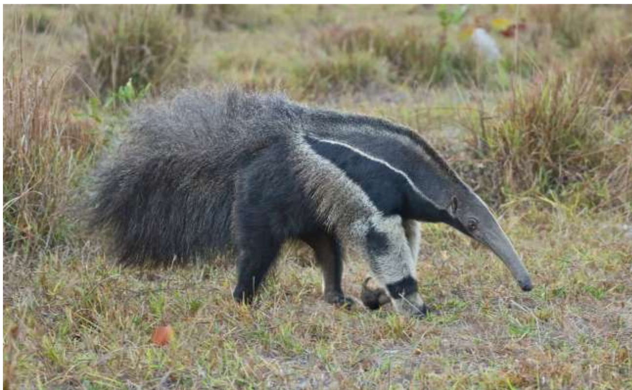
Giant Anteater, Pousada Piuval, Transpantaneira

August 17, Day 13: Piuval to Cuiabá. We will have another full morning to enjoy the abundant birding and wildlife possibilities that Piuval has to offer. After lunch, we will checkout and begin working our way back to Cuiabá, keeping our eyes open for any different raptors or for seasonally nomadic flocks of seedeaters along