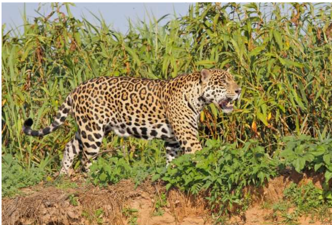
Jaguar (male), rio Cuiabá

Lying in the seasonally flooded basin of the Paraguay River, the vast lowlands of the Pantanal are home to countless numbers of waterbirds, raptors, and other wildlife. The abundance and diversity of large mammals (Capybara, Giant Otter, Marsh Deer, Brazilian Tapir, Black Howler Monkey, Ocelot, Puma, Crab-eating Fox, and South American Coati) coupled with throngs of