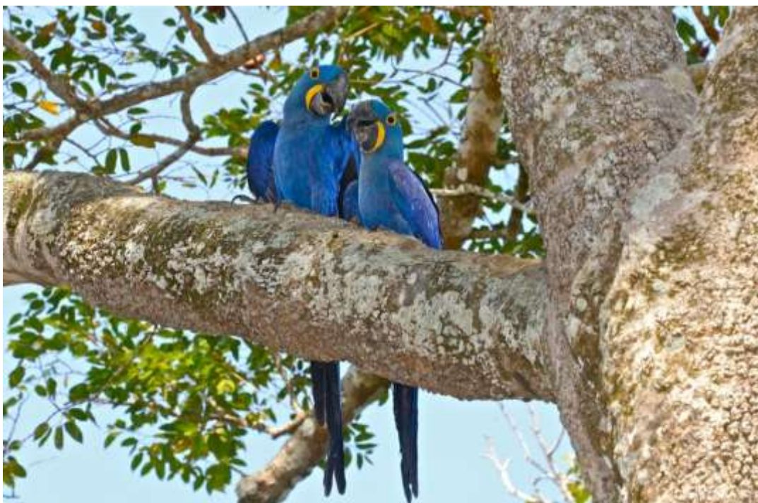
Hyacinth Macaws, rio Piquirí, Pantanal

year to year), and depending on water levels, it's here that we could be treated to flocks of waterfowl including Muscovy Duck, Brazilian Teal, and Black-bellied and/or White-faced whistling-ducks. Parrots are also well represented in the Pantanal, among them fast-flying groups of Yellow-chevrons Parakeets, screeching colonies of Monk Parakeets, Turquoise-fronted Parrots, and colorful Yellow-collared Macaws. However, one member of this family stands out above all others, the fabulous Hyacinth Macaw—biggest and most spectacular of its tribe and a near endemic of this region. These incredible blue-and-yellow birds will be one of the primary targets as we travel through the Pantanal. We'll also make one or more stops along the southern half of the Transpantaneira, to look for the stunning Scarlet-headed Blackbird, an uncommon and localized resident of marshes vegetated with a mixture of papyrus and Alligator Flag.