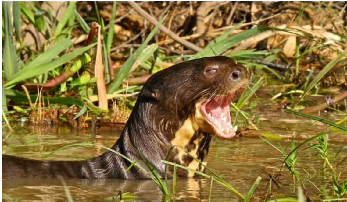
Giant Otter, Corixo Negro, Pantanal

August 14, Day 10: SouthWild Pantanal and the rio Pixaim. We'll have an entire day to enjoy birding once again the area surrounding SouthWild Pantanal lodge and the gallery forest up and down the rio Pixaim. This will likely start with the pre-breakfast rush of activity right around the lodge, with a focus on the many species that visit the lodge feeders and/or any flowering trees on the grounds. The cool of the early morning is a prime time to look for birds typical of the brushy fields adjacent to the lodge, such as Long-tailed Ground-Dove, Striped Cuckoo and Chotoy Spinetail, all of which tend to go silent and become less conspicuous as the sun gets higher. Early morning is also a time when piping-guans and Chestnut-bellied Guans can often be found feeding on the flowers of any flowering trees, particularly if the abundant Pink Ipê trees are in bloom. This is also a prime time for photographers to climb the tower that looks out on a Jabiru nest. The tower is positioned such that the early morning sun is at your back, bathing the Jabirus in a warm, pink, first light, and is ideally situated at eye-level and close range.