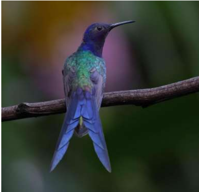
Swallow-tailed Hummingbird Eupetomena macroura

As is the case anywhere in tropical forests, there are a number of skulking birds of the forest interior at both sides of the falls, and seeing them will require special effort and luck. Some of these species are Pavonine Cuckoo, Rusty-breasted Nunlet, Short-tailed Antthrush, Russet-crowned Spadebill, and Southern Antpipit.